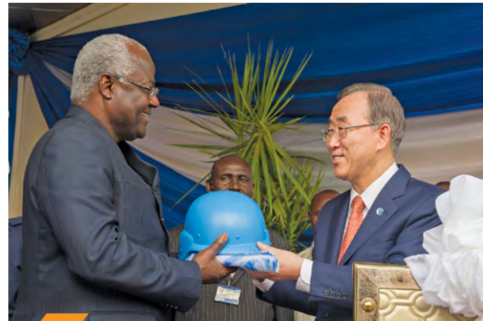
Secretary-General Ban Ki-moon with Ernest Bai Koroma, President of the Republic of Sierra Leone.

Office in Sierra Leone (UNIPSIL). Following a PBC assessment mission to Sierra Leone in February 2013, PBSO launched new PBF-supported project streams backing popular consultations on proposed revisions of the constitution, new efforts in SSR and the strengthening of human rights institutions.