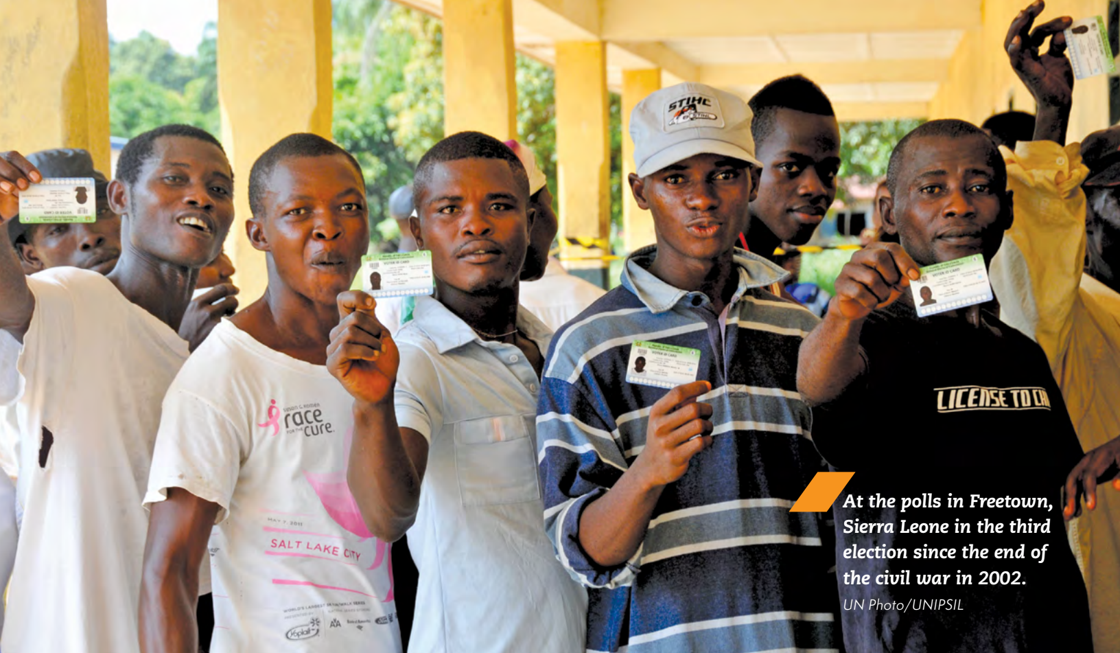
At the polls in Freetown, Sierra Leone in the third election since the end of the civil war in 2002.