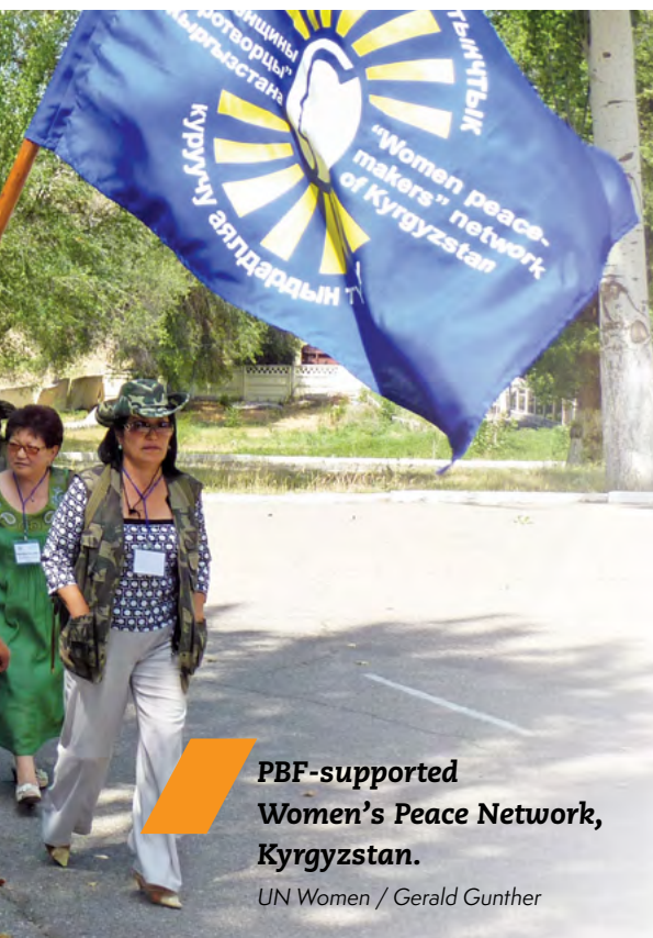
PBF-supported Women's Peace Network, Kyrgyzstan.

Building on the first package of PBF support, authorities in Kyrgyzstan established a Joint Steering Committee in 2013, in which civil society, the UN system and development partners are included. It represents the country's first platform that enables diverse actors to engage in dialogue and agree on the path towards lasting peace. Also in 2013, PBSO approved a US$ 15 million grant for projects supporting multilingual education, minority representation and more inclusive local self-government. ▀