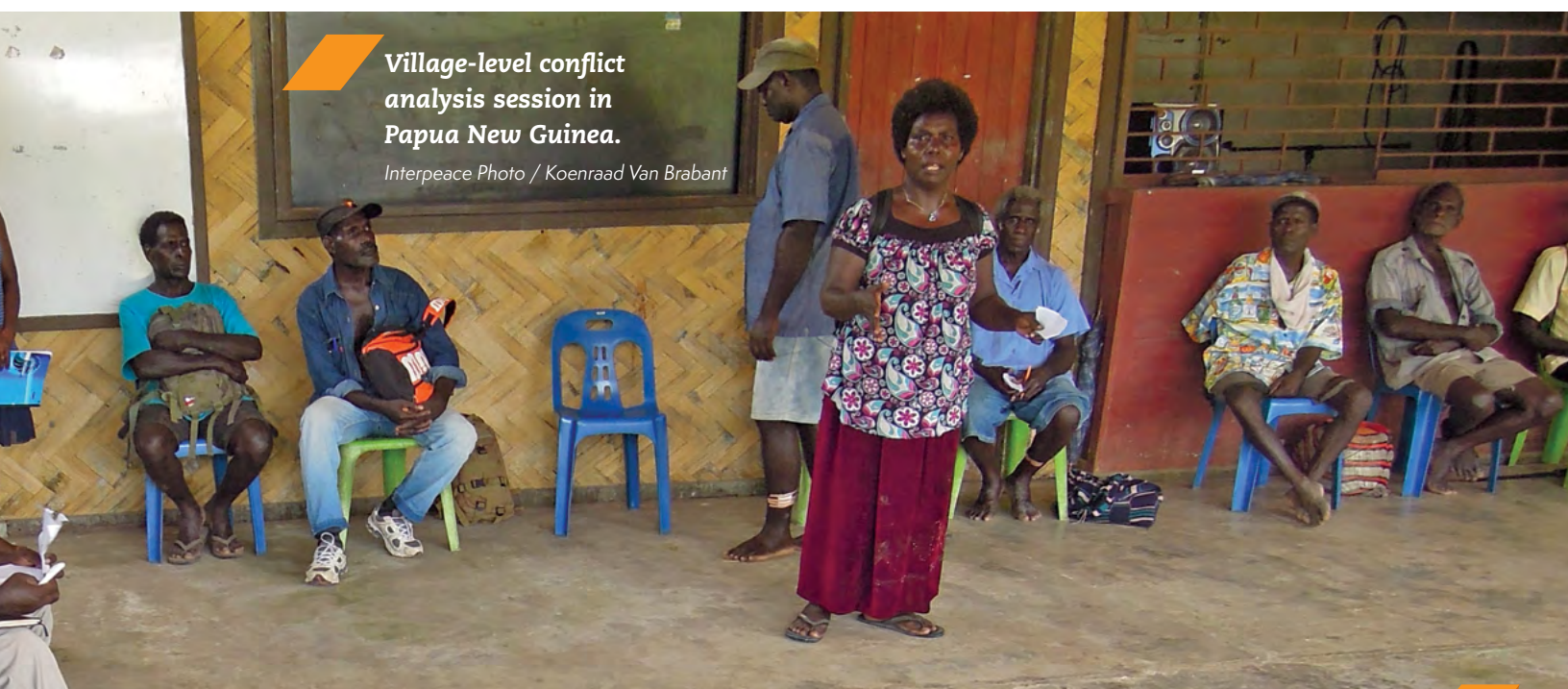
Village-level conflict analysis session in Papua New Guinea.